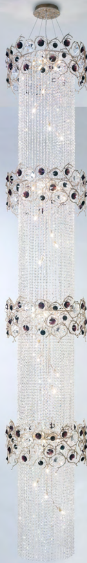
PHOTO FOR ILLUSTRATION PURPOSES ONLY - 4-TIER SHOWN