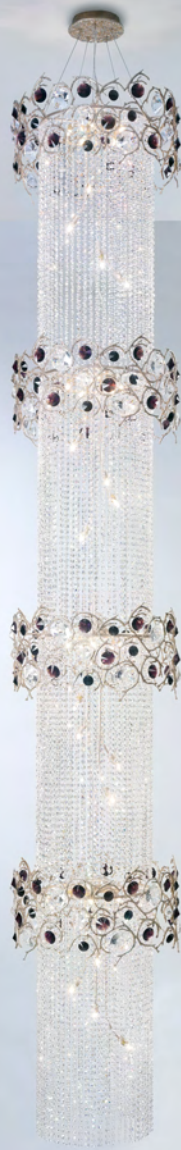
PHOTO FOR ILLUSTRATION PURPOSES ONLY - 4-TIER SHOWN