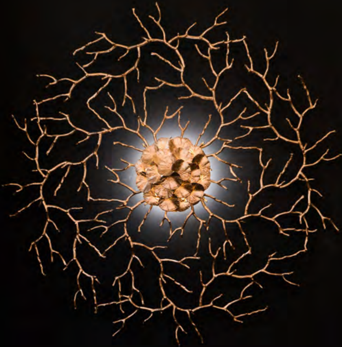
PHOTO FOR ILLUSTRATION PURPOSES ONLY - LARGE SCULPTURE SHOWN