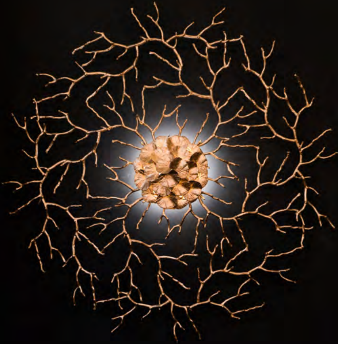
PHOTO FOR ILLUSTRATION PURPOSES ONLY - LARGE SCULPTURE SHOWN