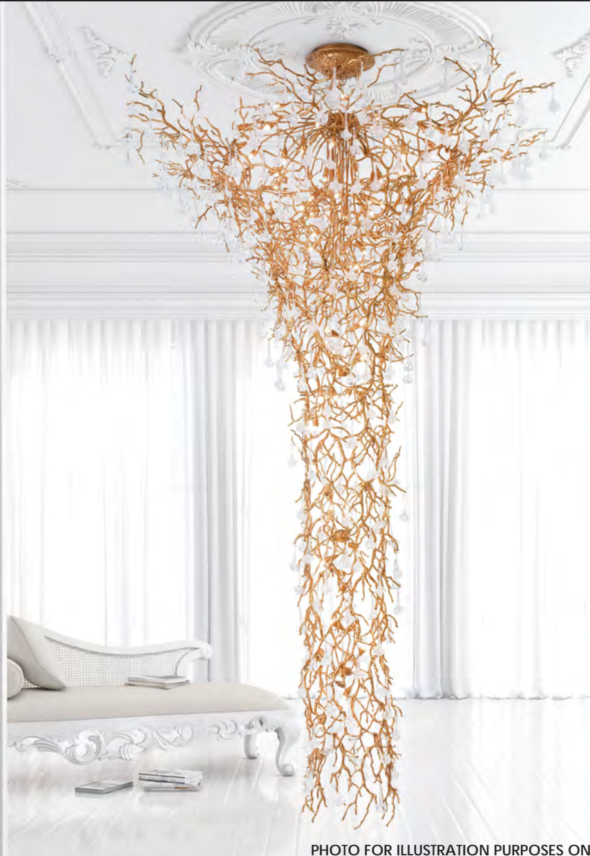
PHOTO FOR ILLUSTRATION PURPOSES ONLY - 79 SPN CHANDELIER SHOWN