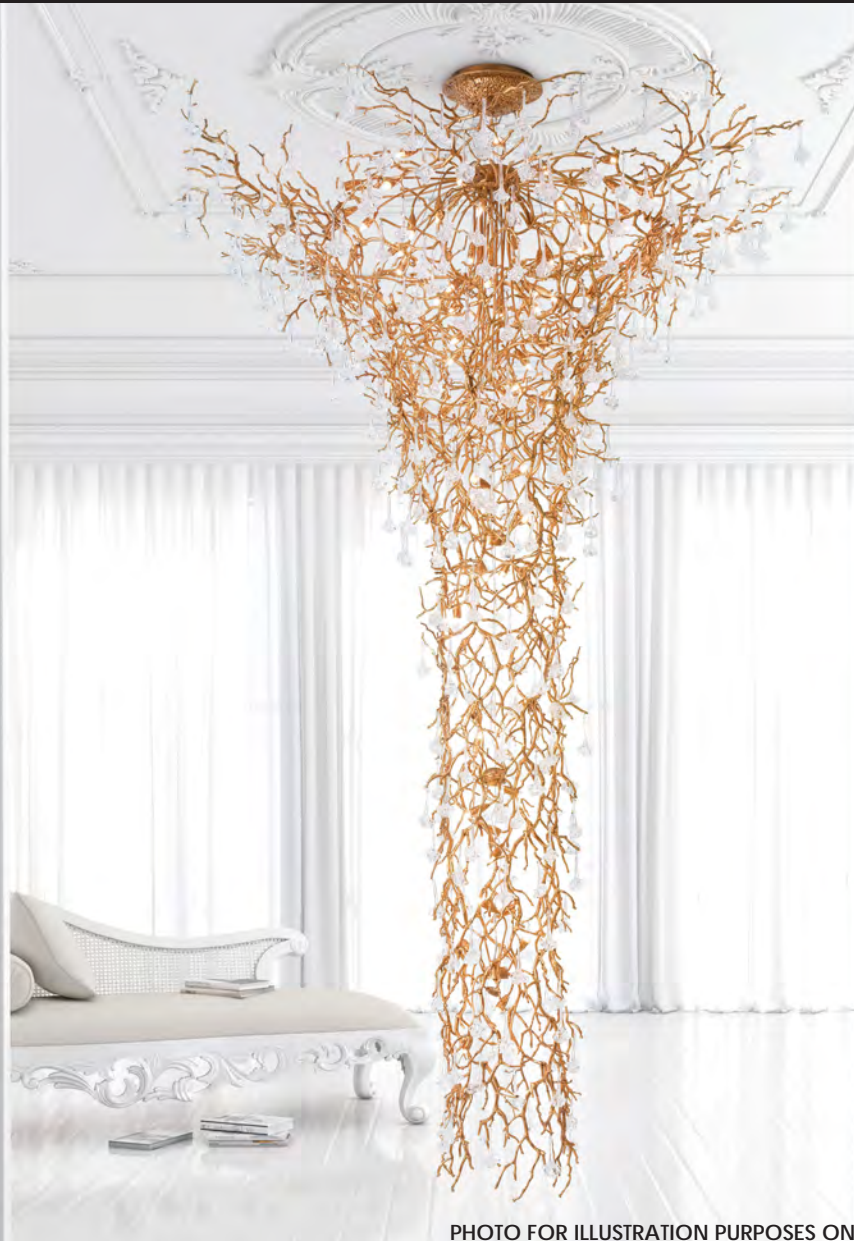
PHOTO FOR ILLUSTRATION PURPOSES ONLY - 79 SPN CHANDELIER SHOWN