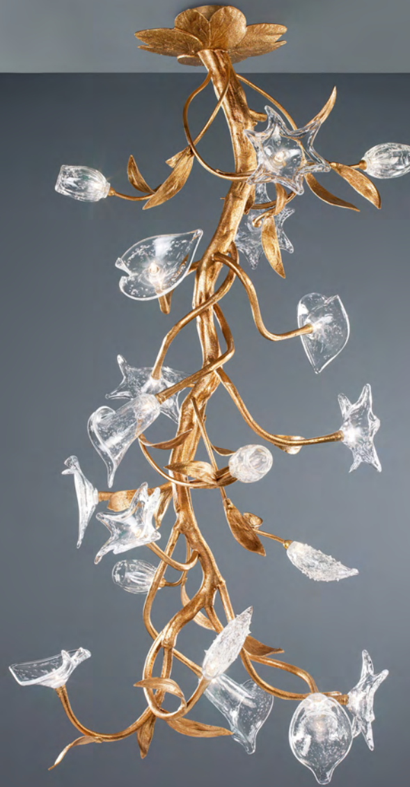
PHOTO FOR ILLUSTRATION PURPOSES ONLY - SMALL STAIRCASE SHOWN