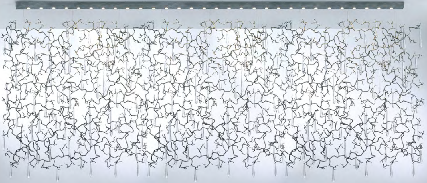
PHOTO FOR ILLUSTRATION PURPOSES ONLY - 3X- LARGE PANEL SHOWN