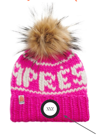
Optional: Add embroidered logo or patch (extra $30/beanie)