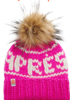
Step 2: Pick your stripe & word color