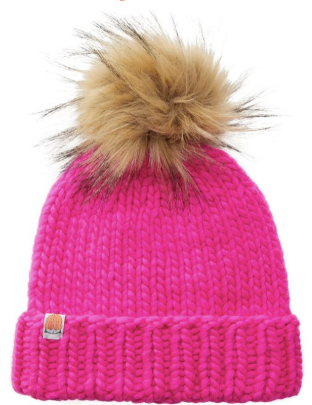
Step 1: Pick your base color