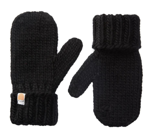
Step 1: Pick your base color