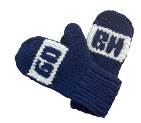
Step 2: Pick your letter background and letters (2 letters per hand max)