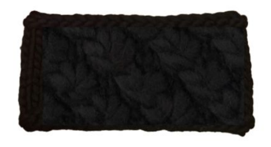
Step 1: Pick your base color