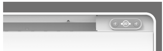
SIBTE - ELECTRONIC