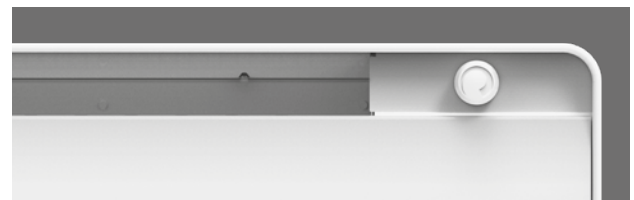
SIBTx - MECHANICAL