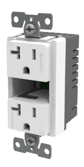
20A, 125VAC 5VDC, 2.0A NEMA 5-20R