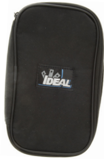
C-357 Nylon Carrying Case