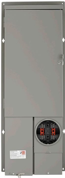
Solar-Ready Meter-Load Center Combination, All-in-one, UG/OH* Service Entrance, EUSERC