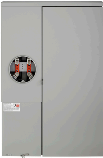
Meter-Load Center Combination, All-in-one, UG Service Entrance, EUSERC