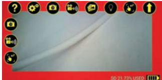
Non contact voltage detector visual alarm