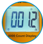
Delta \Delta (difference from reference)