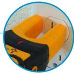
Non-Contact Voltage Indication Built in Clamp Tip