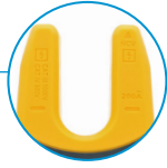
0.75 in. (19mm) Jaw Opening