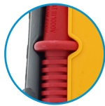
Probe Storage & Lead Holders (on back)