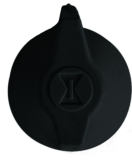
146MT579 Knob-Wall Switch FF Series - Black