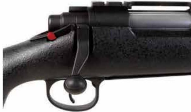
SAFETY ON Trigger is secure and cannot fire