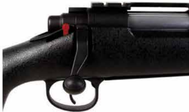
SAFETY OFF Gun will fire when the trigger is pulled