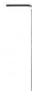
2.5mm Allen Key Provided and used to adjust the Hop Up

When adjusting the Hop Up for the ASR you need to test fire in a SAFE location and know what is past the target to prevent damages and or injuries.