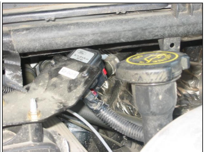
MAP Sensor 99-Up (Figure 2)

Questions: Send email to Support@dfuser.com dfuser.com 13701 Ranch Road 2338 Georgetown, TX 78628-9500