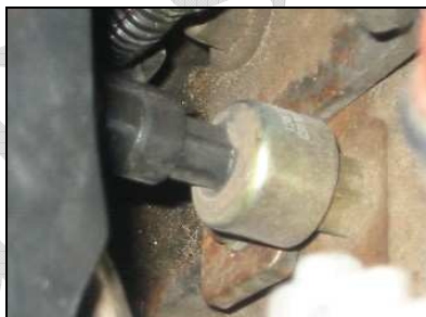
ICP (Figure 2)

Some vehicles will not be able to use the full power of this module due to variance in the HPOP. Adjust your module accordingly. Start in the high setting, with dial wide open, and work your way down to insure your SES light does not come on. Once you determine the level where you SES light are not triggered, this should be your highest setting.