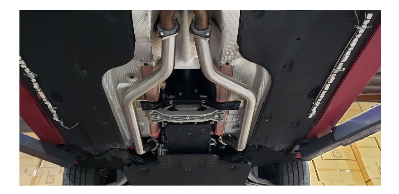
THANK YOU FOR CHOOSING DC SPORTS