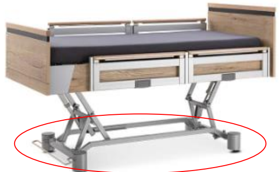
Lower Frame causes issue for Patient Lifts, OBT, and Cleanability