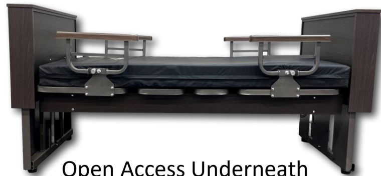
Open Access Underneath Bed