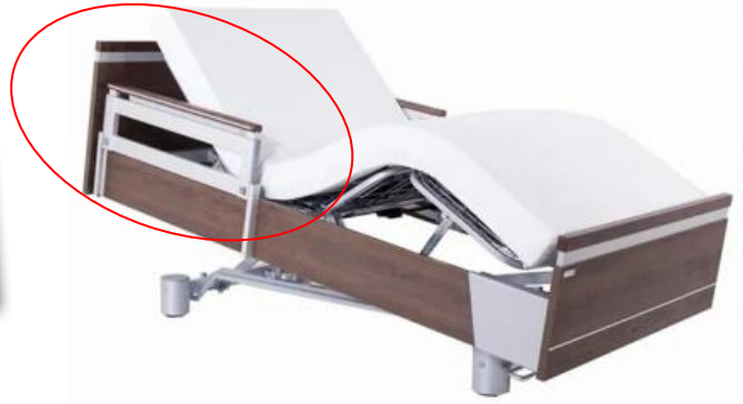
SideRails fixed to lower frame providing zero protection when Head or Knee section is raised causing falls risk and entrapment concerns