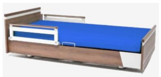
Max Patient Weight 418lbs