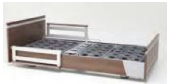
Fixed width 39"