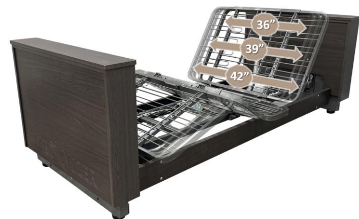
Bed Expands Toolless from 36" > 39" > 42"