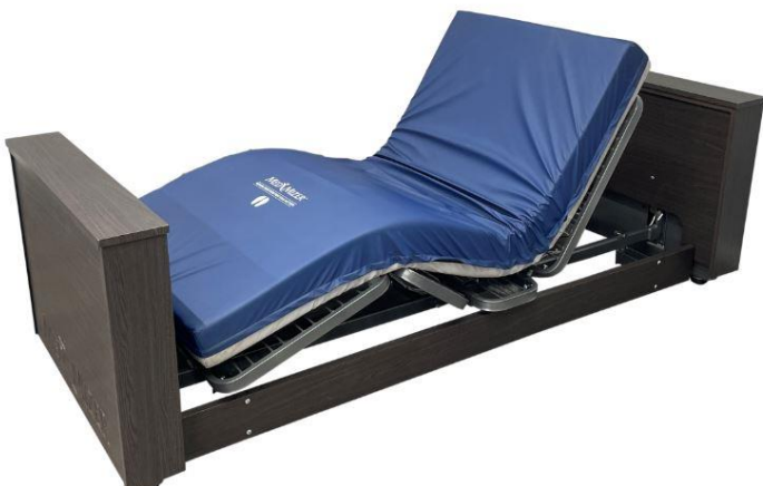
Max Patient Weight 600lbs