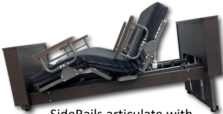
SideRails articulate with the sleep deck to protect patient during use