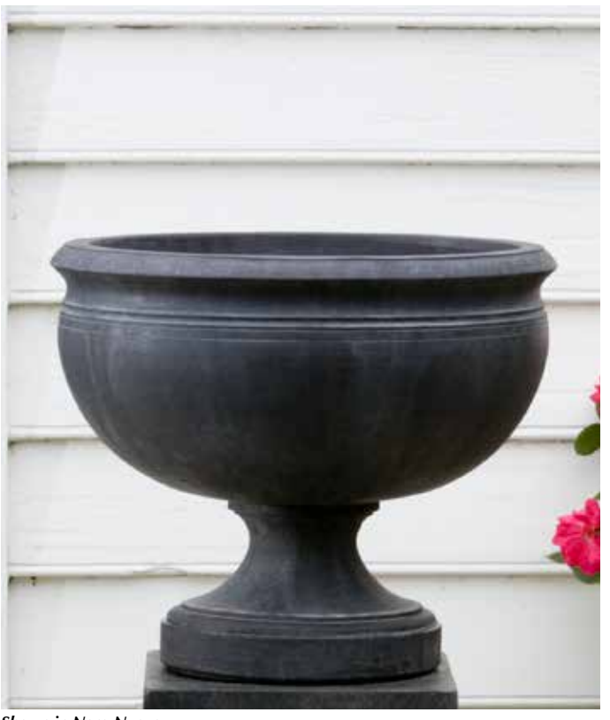
Shown in Nero Nuovo