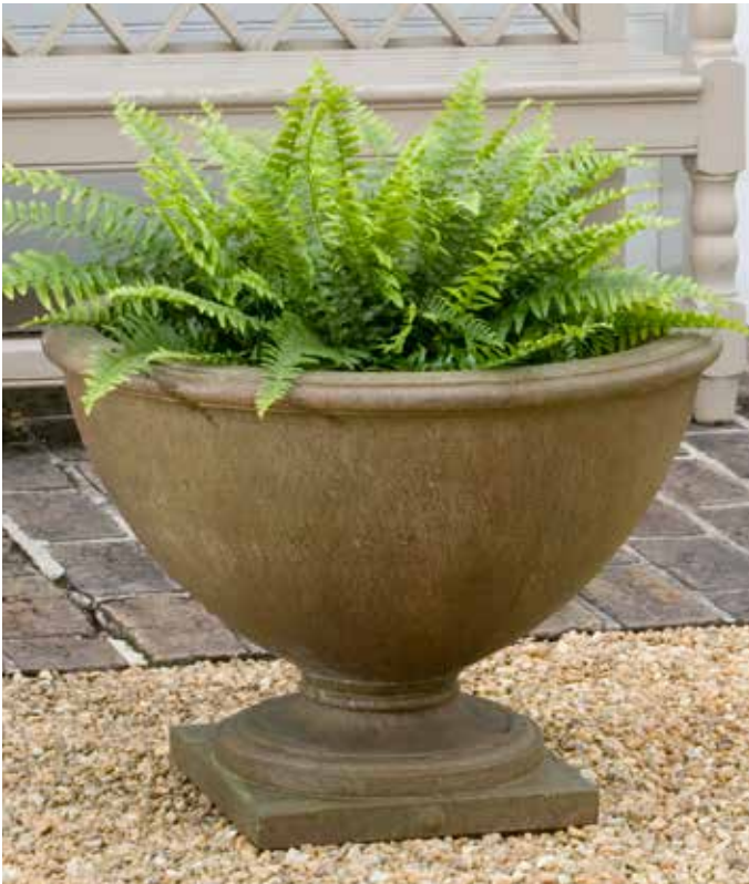
Shown in Aged Limestone