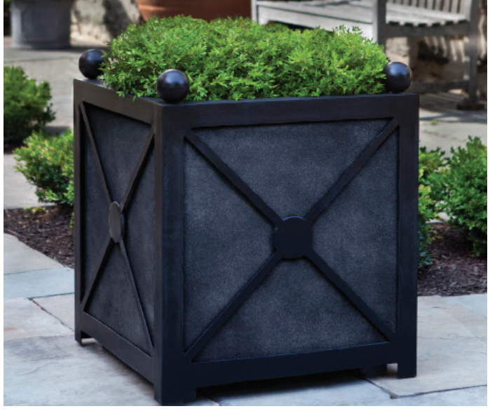
Shown in Lead