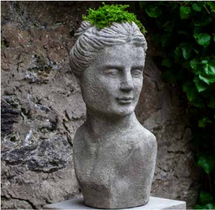
Shown in Greystone