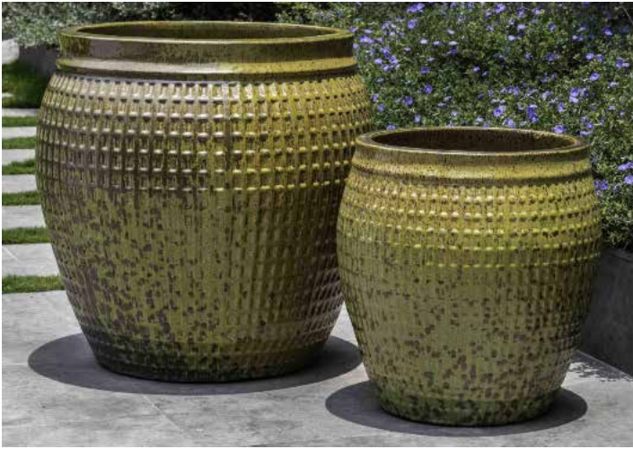
Shown in Tropical Avocado