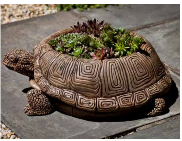
Shown in Brownstone