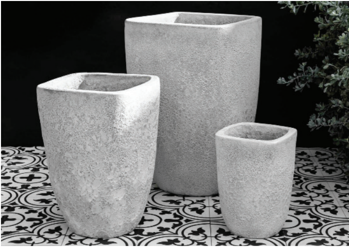
Shown in White Coral