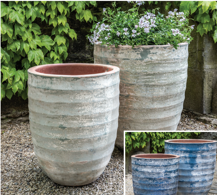
Shown in Vicolo Terra