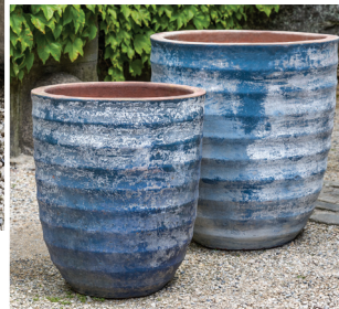
Shown in Vicolo Mare