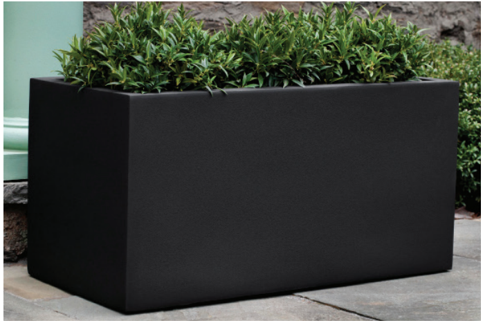
Shown in Onyx Black