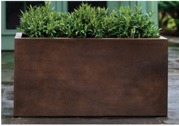
Shown in Rust