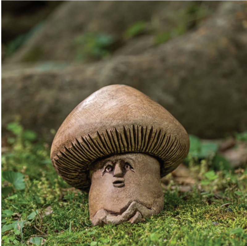
Shown in Brownstone