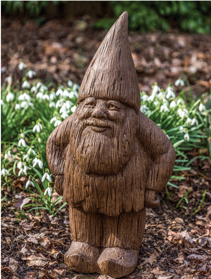
Shown in Pietra Nuova

Available in a choice of thirteen (13) exclusive natural pigment stains in addition to natural. All of our patinas are hand applied in a multi-step process which produces unique and beautiful surface finishes. Designed to replicate the look of naturally aged materials, the patinas will not prevent the natural aging process that occurs in an outdoor environment. Rather than creating uniform stains, our approach gives our products their unique beauty and appeal.