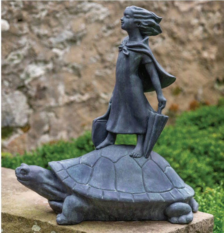
Shown in Lead Antique