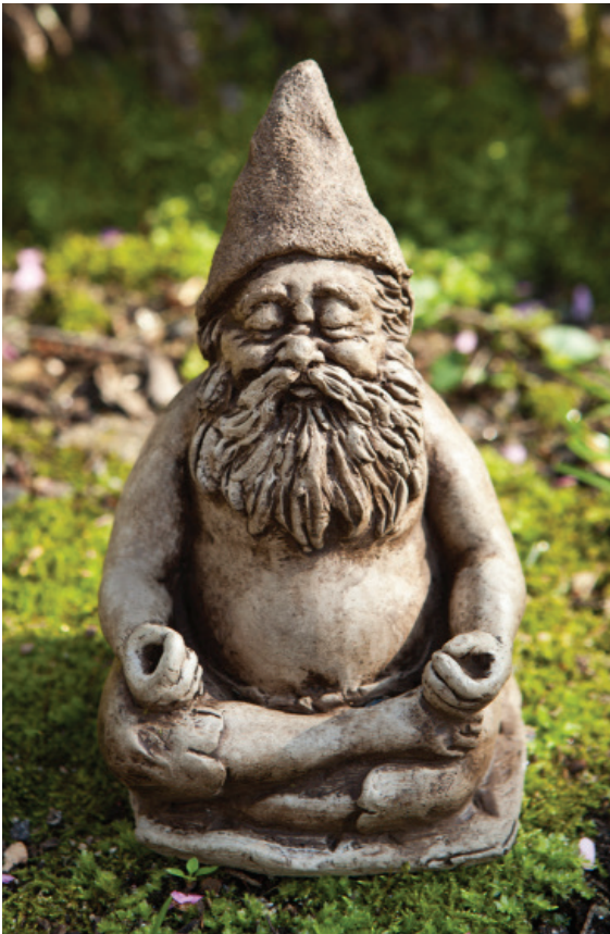
Shown in Brownstone