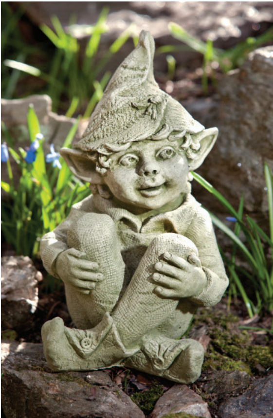
Shown in English Moss