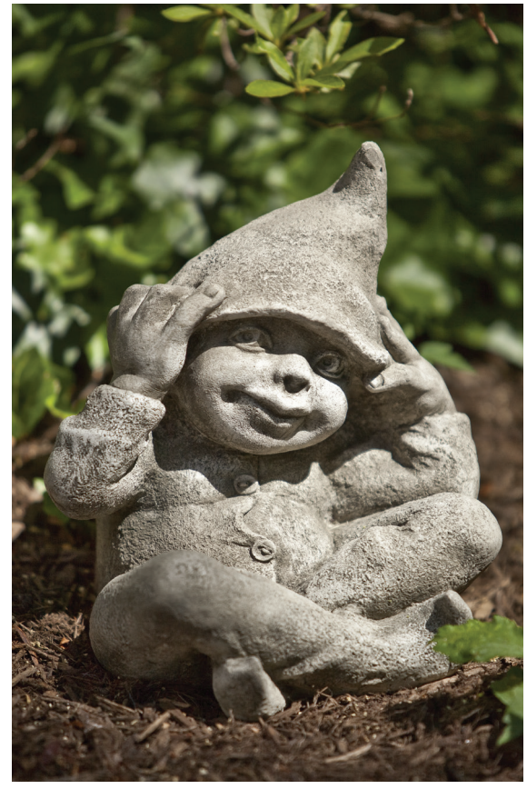
Shown in Verde