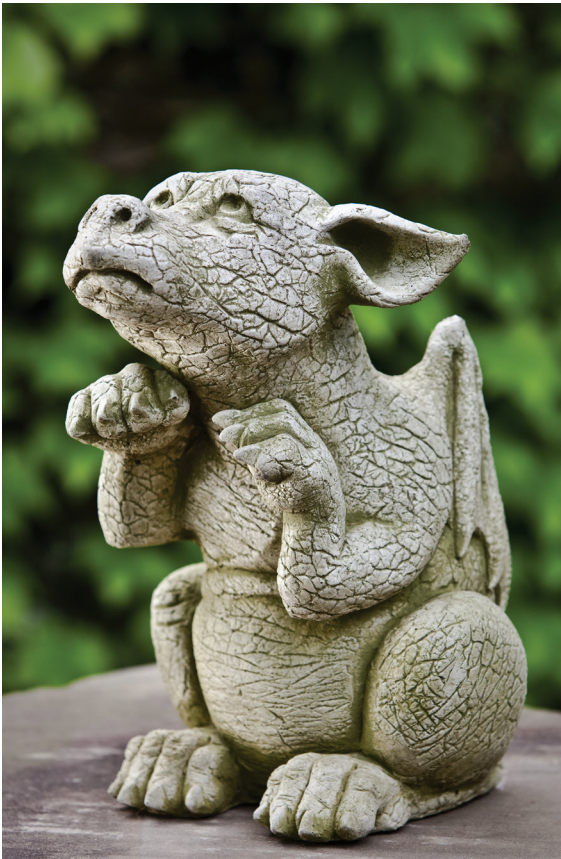
Shown in English Moss