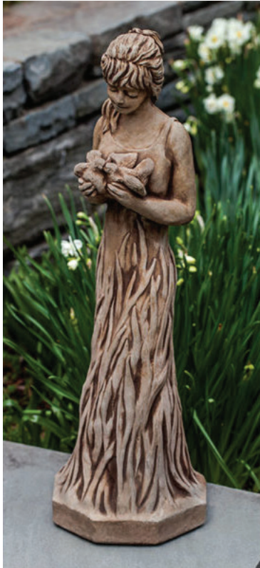
Shown in Brownstone