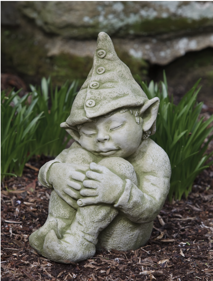
Shown in English Moss