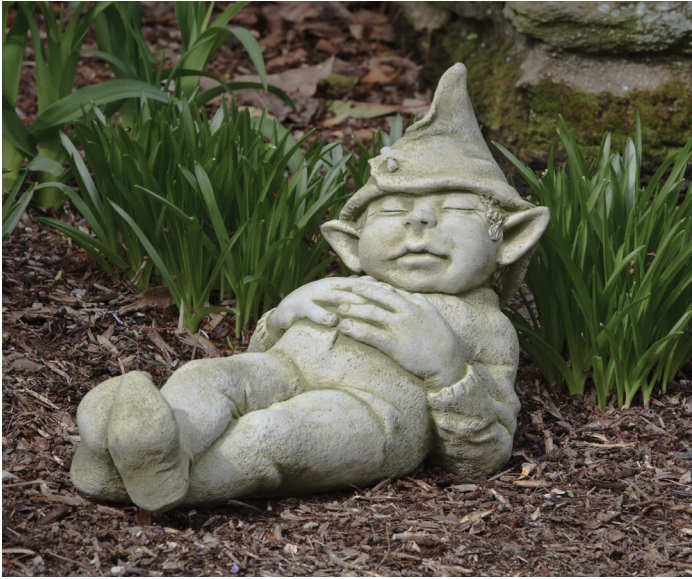
Shown in English Moss

Campania proudly manufactures its cast stone products in the USA using locally sourced materials. All of our cast stone pieces are manufactured using the wet casting technique with a proprietary high density cast stone mix, yielding a PSI strength of approximately 7,500. The mix is comprised primarily of water, sand, stone aggregate and cement. Our cast stone products may qualify for LEED credits as applicable to your project. Cast stone produces a strong and durable product that will weather naturally in an outdoor environment. Simply stated, cast stone is chosen for its beauty and authenticity. Our material is natural, authentic, made in the USA, and 100% recyclable. These planters are often specified for hospitality projects, large scale public space installations, pedestrian and traffic safety, and other custom projects. Although we recommend that you take advantage of the quick turnaround of our stocked product; these shapes, finishes, and/or sizes are not always right for every job. Campania has the capability to produce custom molds and colors in our Pennsburg, PA factory.