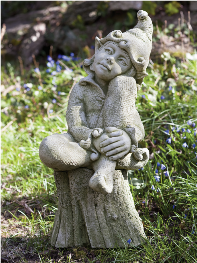
Shown in English Moss