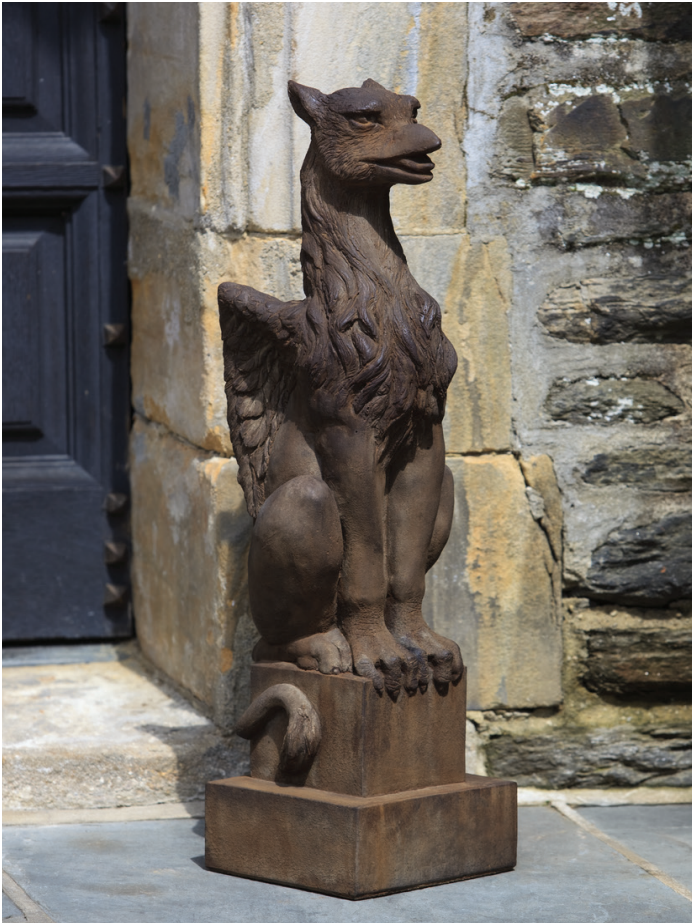
Shown in Pietra Nuova