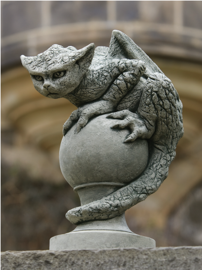
Shown in Alpine Stone