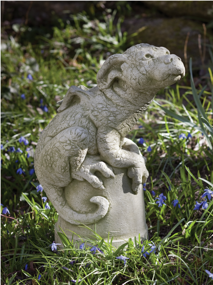
Shown in English Moss