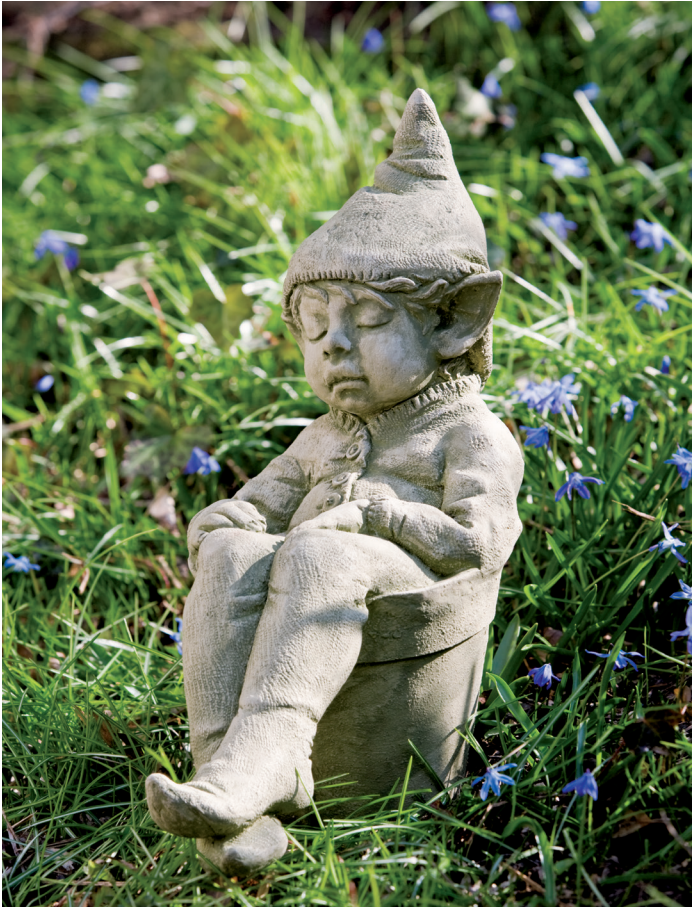
Shown in English Moss