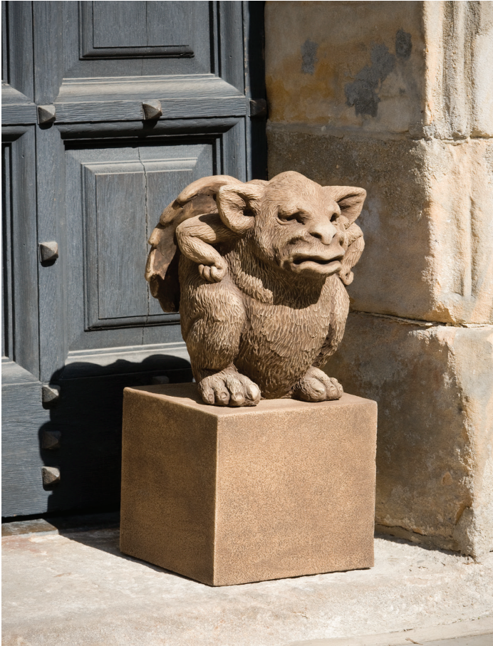
Shown in Brownstone on PD-171