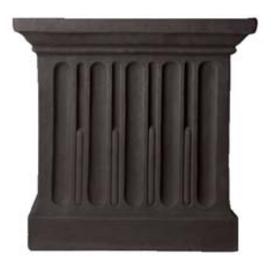
Terra Nera (TN)*