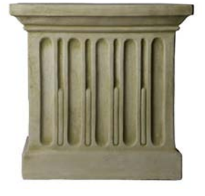
English Moss (EM)