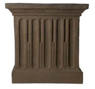
Pietra Vecchia (PV)*