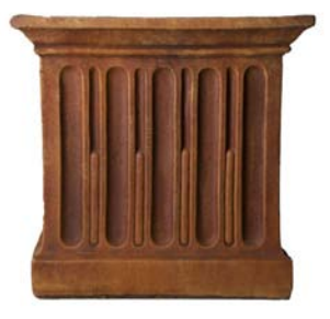
Ferro Rustico (FR)*