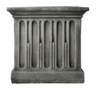
Alpine Stone (AS)

Due to the hand-application process and photography, actual colors may vary slightly from those depicted in these examples. Please consult our catalog photos and our website for examples of variations of our patinas.