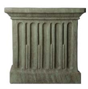
Copper Bronze (CB)