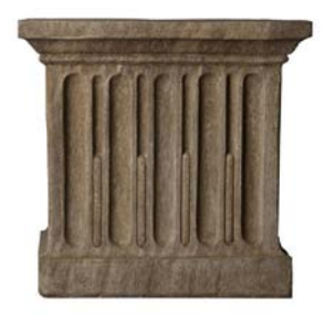
Aged Limestone (AL)