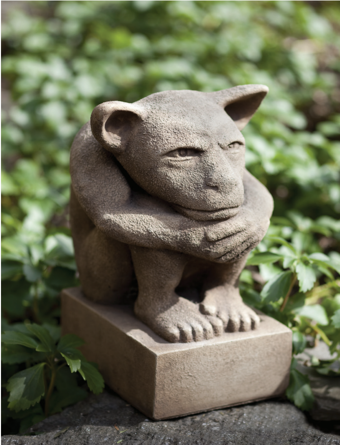
Shown in Brownstone